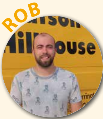
Still Worker Operator

We are pleased to introduce the latest additions to the Watson & Hillhouse workshop team: