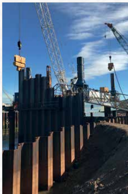
PVE 52M, BSP CX110 and ICE 815C in Boston