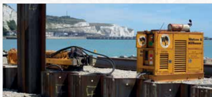
BSP CX110 having a rest after driving 'Z' piles in Dover