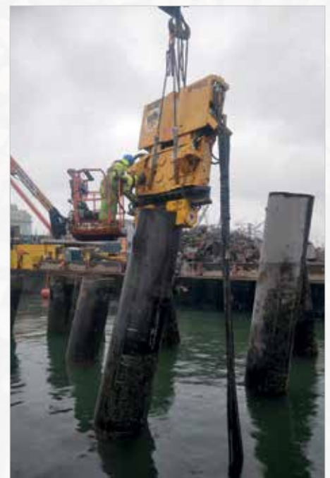
ICE 815C extracting raked piles in Dublin