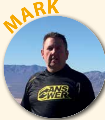
Movax/Still Worker Operator