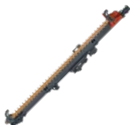
Leader mounted pre-auger/CFA drill