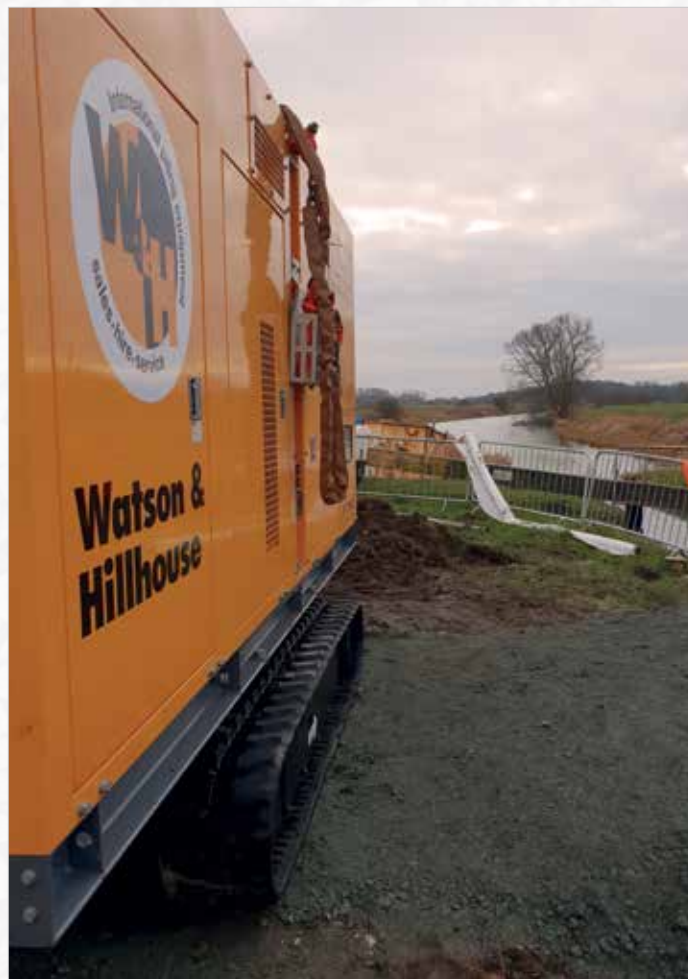
Still Worker power pack on tracks in Yorkshire