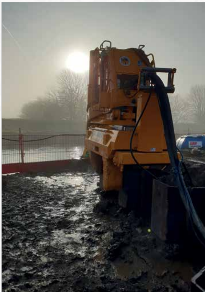
Still Worker WP-150 in Yorkshire

Here's a small selection of our hire equipment working on various sites all over the UK and Europe this year.