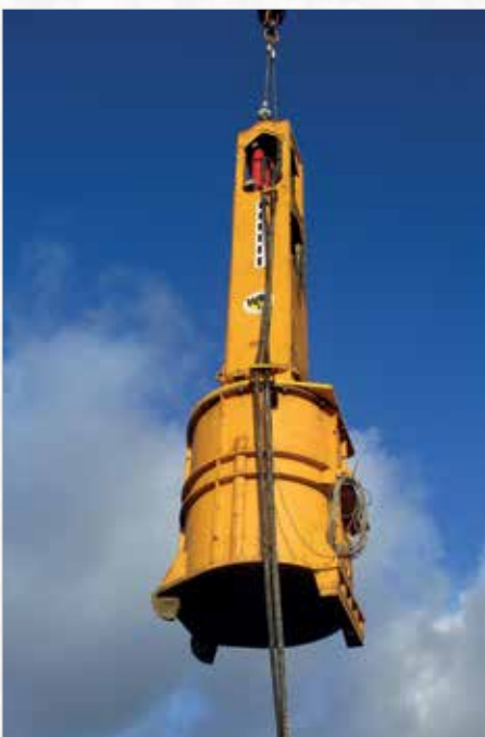
BSP CG in Essex