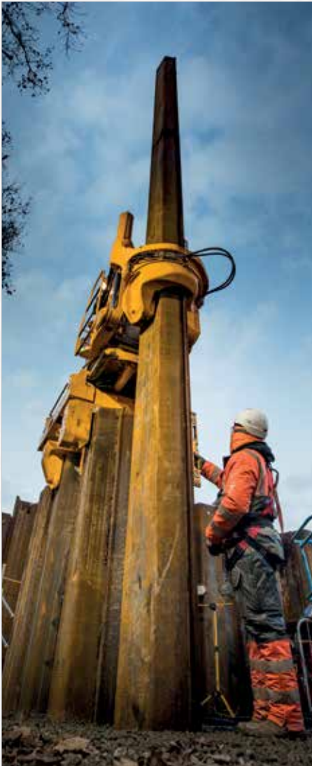
Still Worker WP-150 installing 'U' piles in London