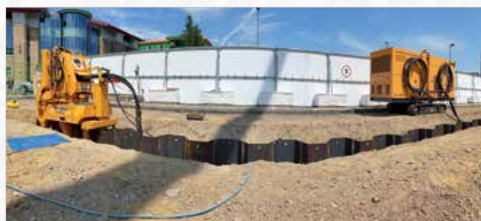
Still Worker WP-150 in Southampton